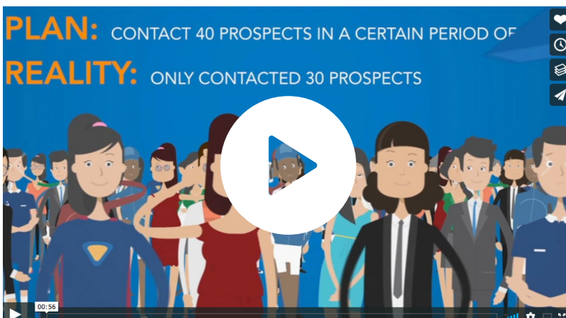
Achieving goals using the S.M.A.R.T. Model