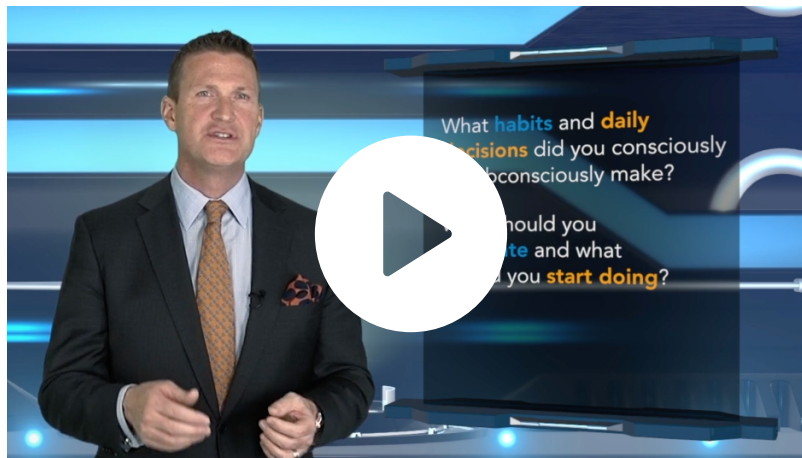
Changing habits can help you achieve more