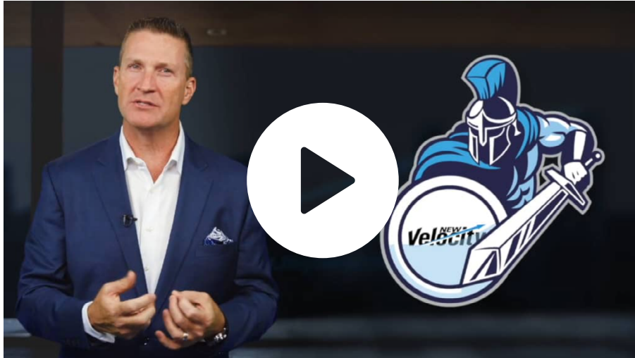
Articulating value that customers will gladly pay for