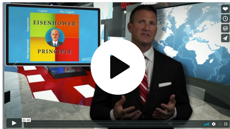
The Eisenhower Principle